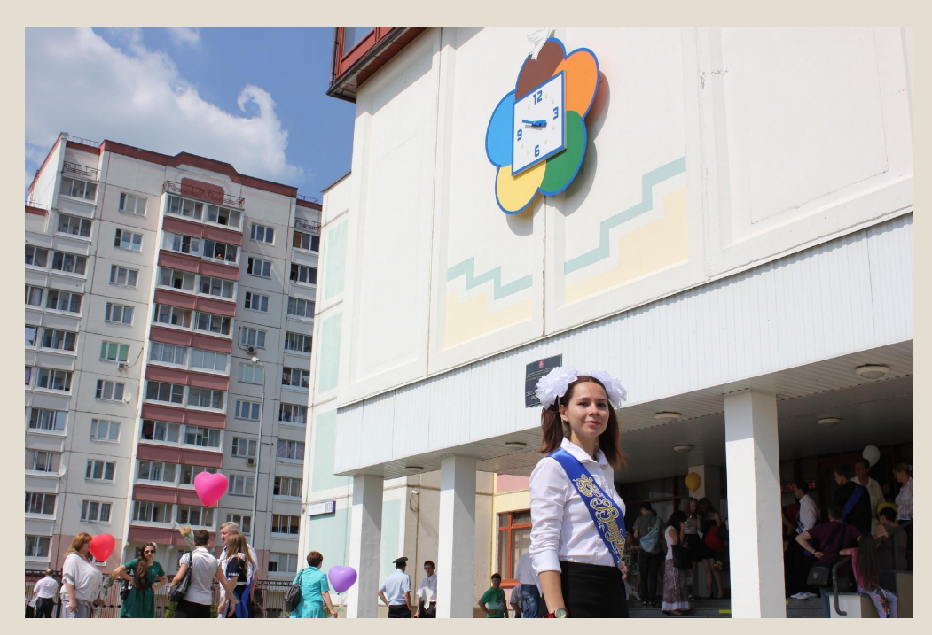
finished from General secondary education school No. 2049

I finished from General secondary education school No. 2049