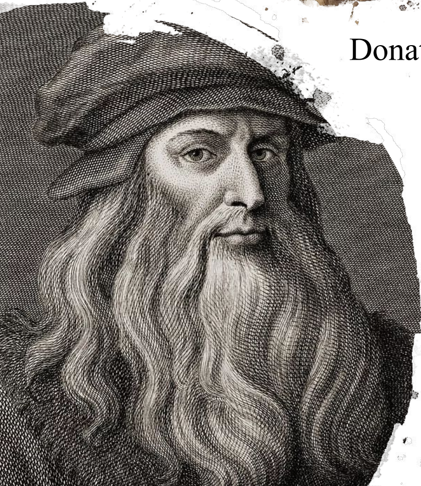
Leonardo Da Vinci

Italy was the birthplace of the Renaissance