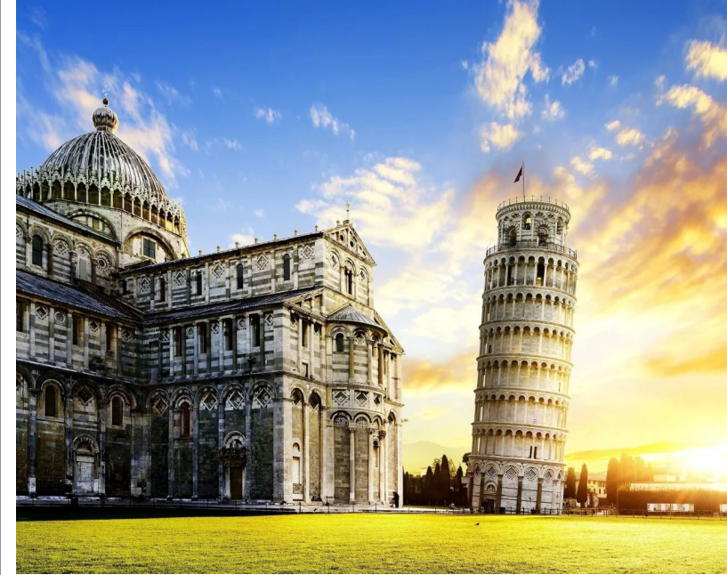
The Leaning Tower of Pisa