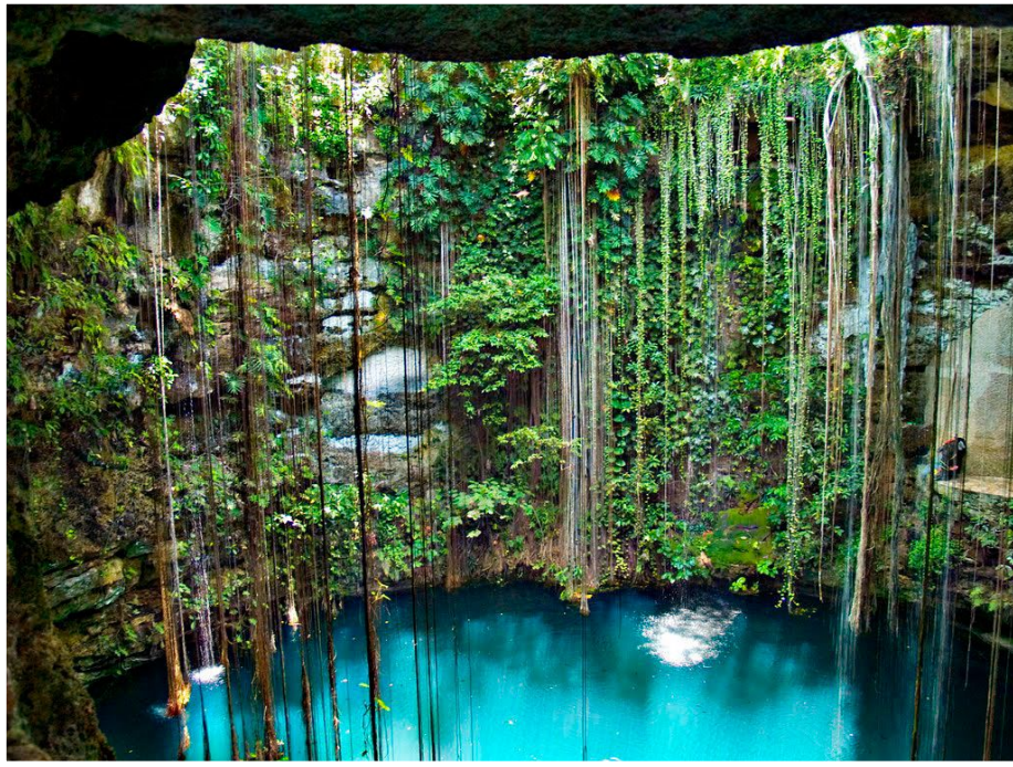
Cenote Ik Kil