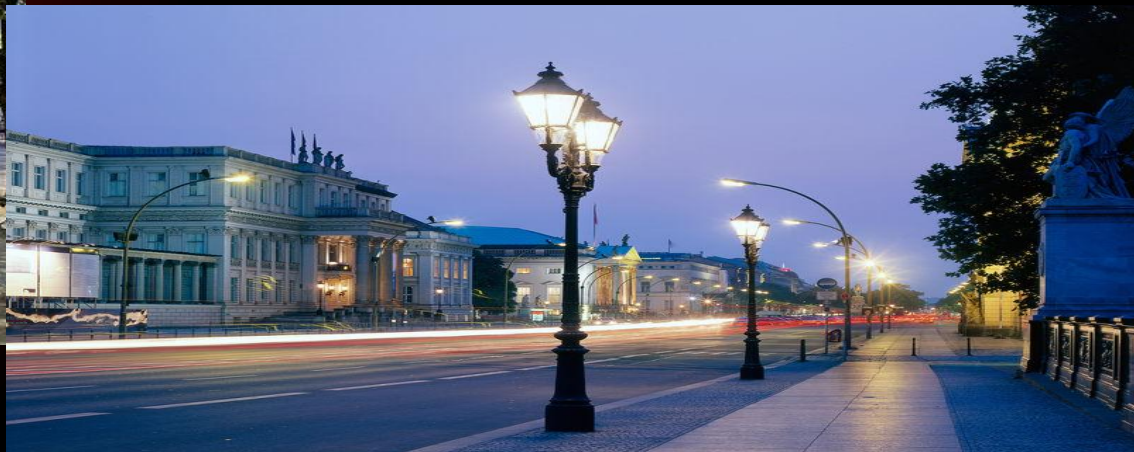
Statue of Friedrich Wilhelm

Unter den Linden Unter den Linden, a main east-west thoroughfare through the city of Berlin, earned its name from the rows of linden trees that were first planted there more than three-and-a-half centuries ago.