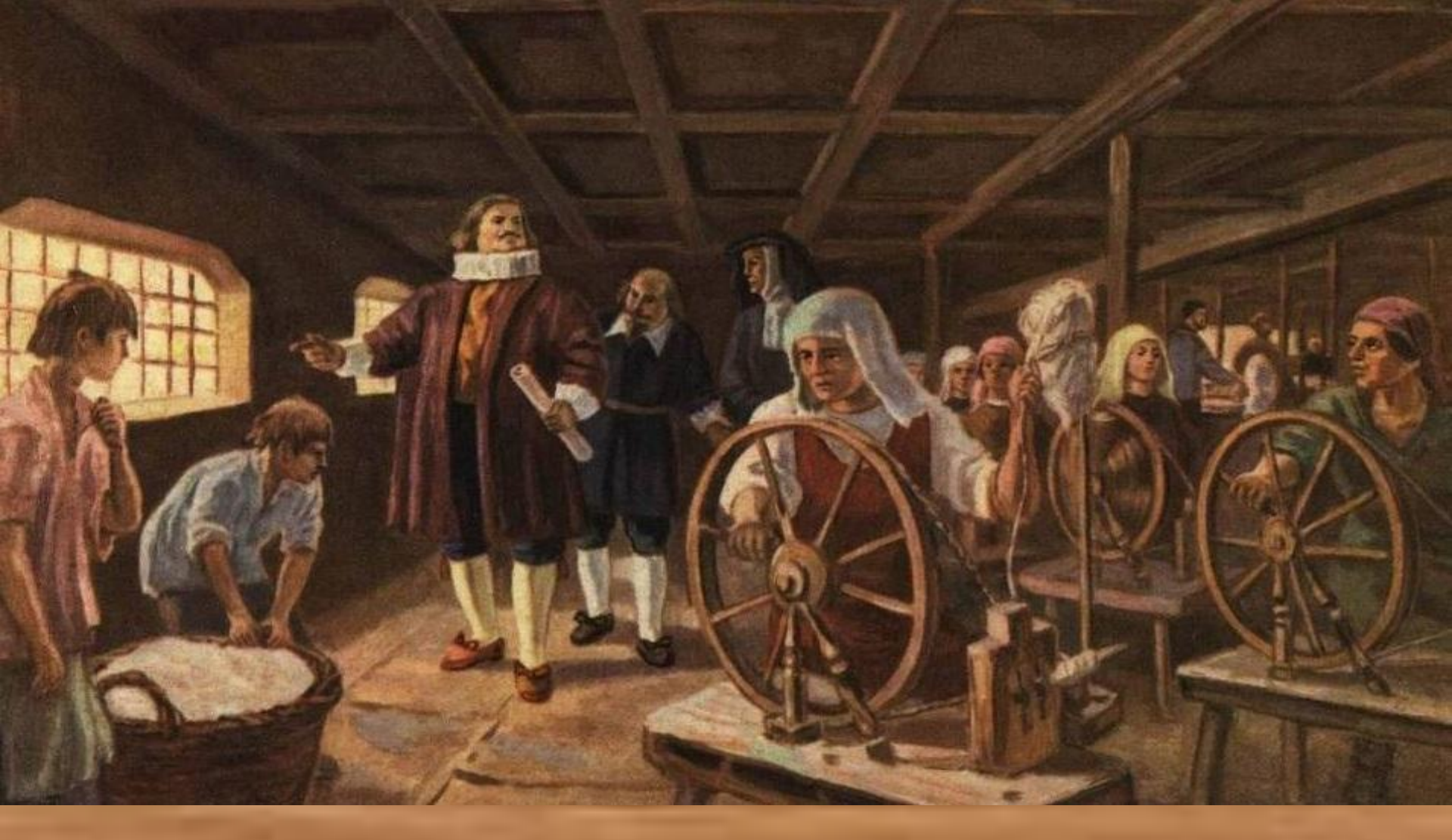
Cotton and wool were made into cloth and exported.