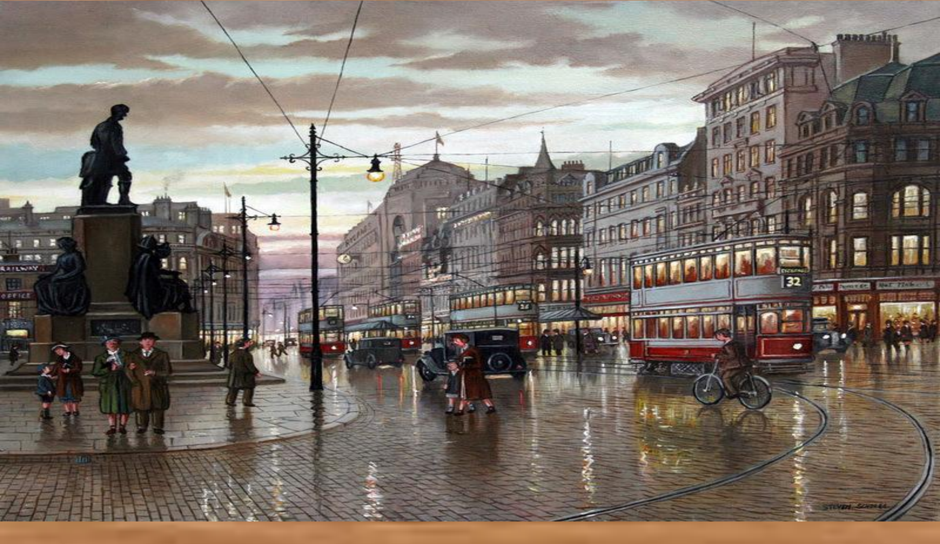
Street lights became a usual thing for British.