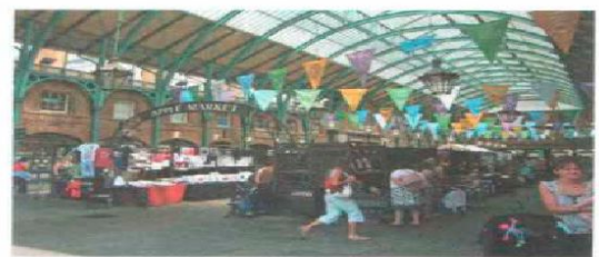
2) New Covent Garden