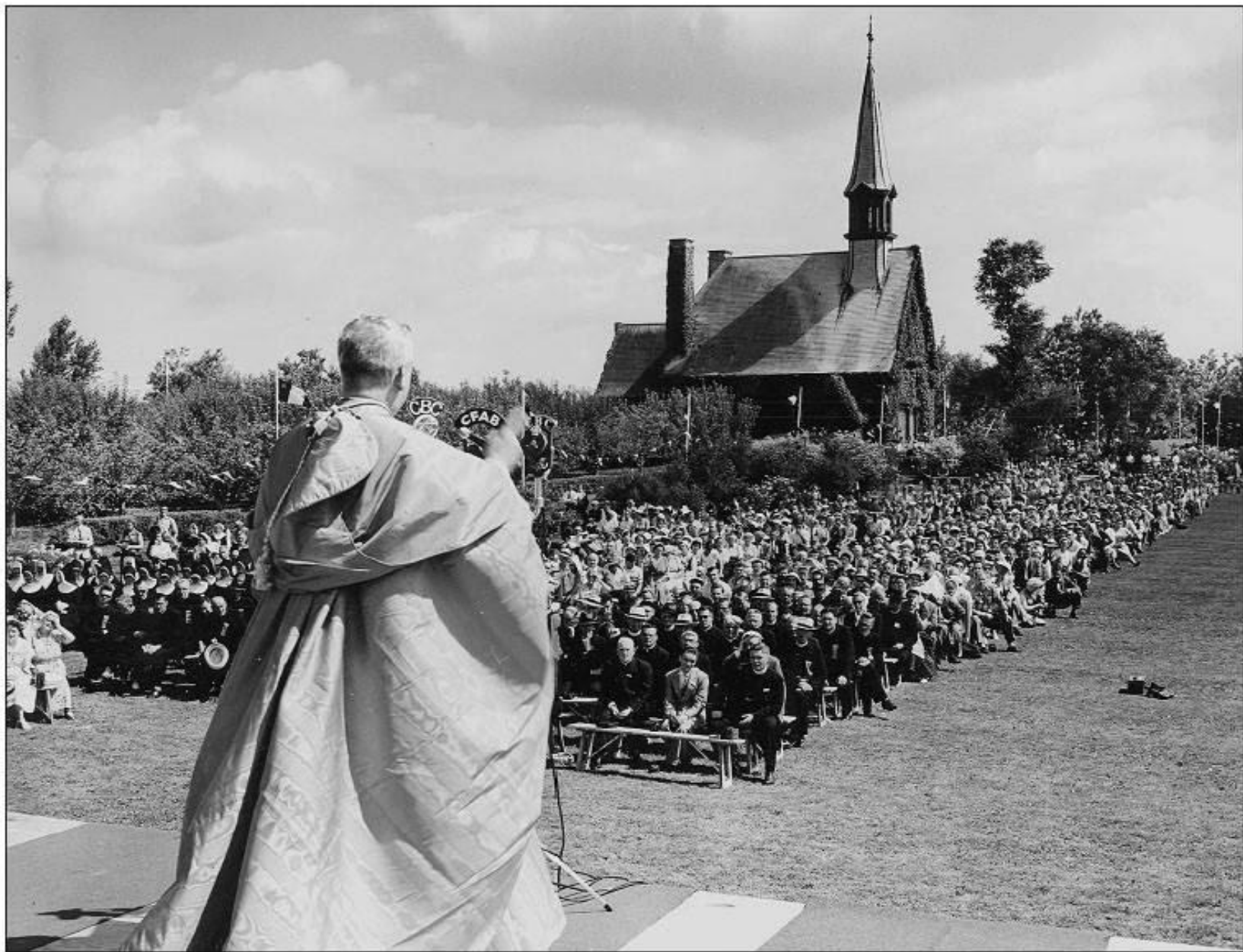
Figure 3: Pontifical Mass held at Grand-Pré during the 1955 bicentennial celebrations. (Centre d'études acadiennes Anselme-Chiasson, PB4-43; PB4-47)