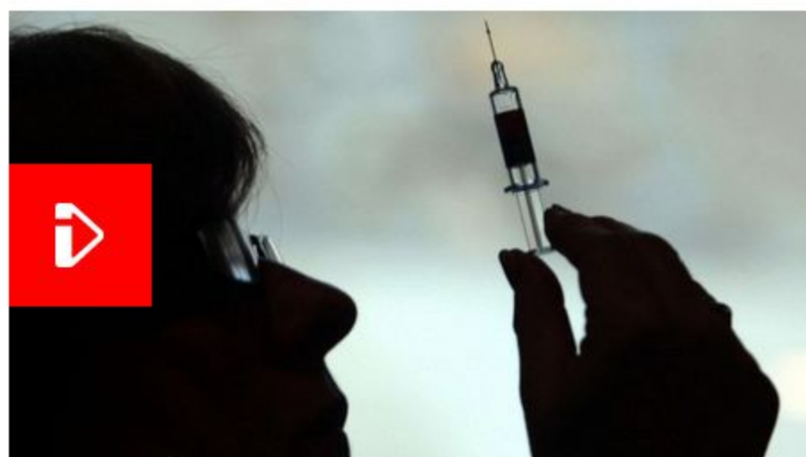
The background to the case

A judge has ruled that sisters aged 15 and 11 must have the MMR vaccine even though they and their mother do not want it, BBC Newsnight has learned.