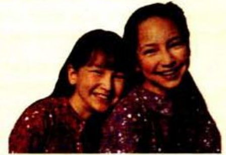
two happy girls