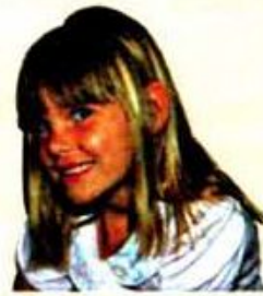
a happy girl

◆ Прилагательные во множественном числе не приобретают окончания -s.