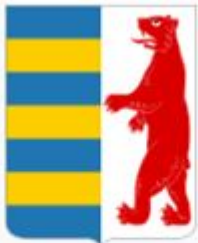
Coat of arms of Carpathian Ruthenia, adopted by some Rusyns