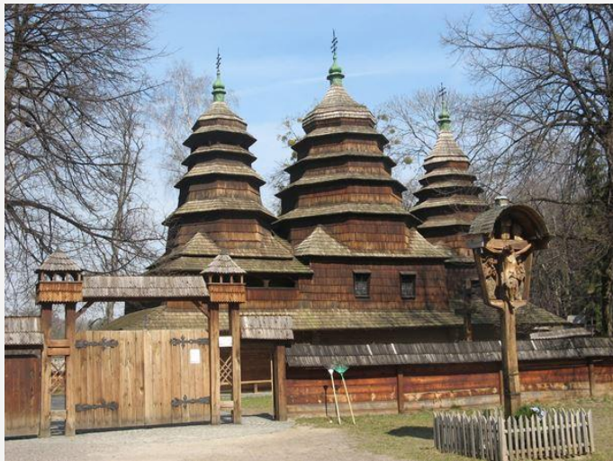
Museum of Folk Architecture and Life (Lviv)