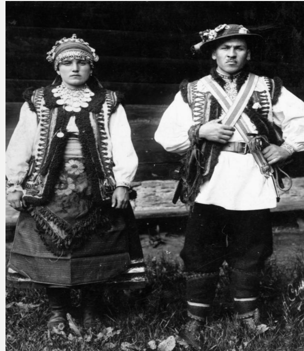
Hutsul family, 1925–1939