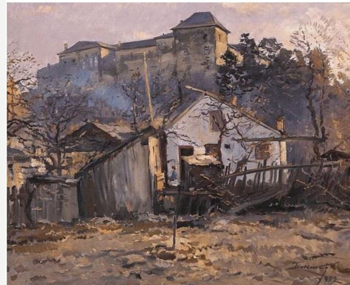
The Castle in Uzhorod (1962) by Iosyp Bokshai