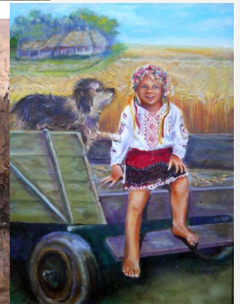
Harvest by Olga Kaczmar