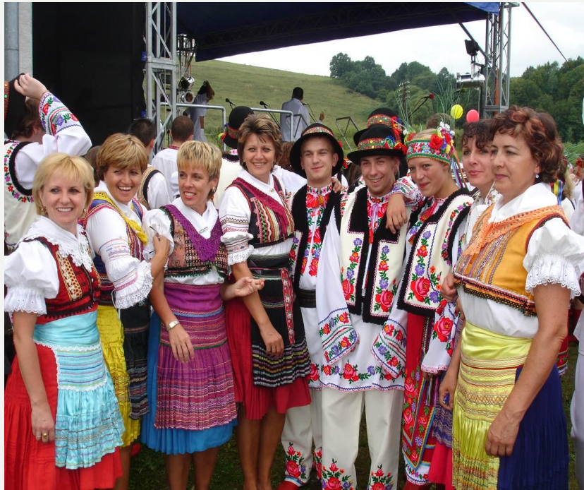
Boykos from Prešov (left side) and Lemkos from Przemyśl