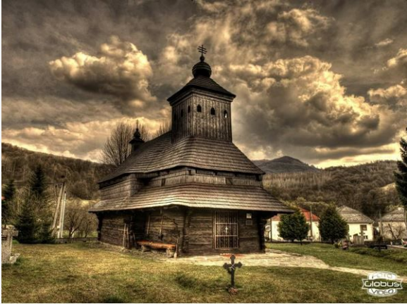
Uličské Krivé, Slovakia