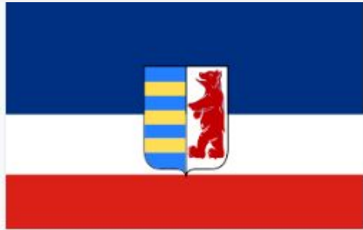
Flag of Rusyns, promulgated by the Academy of Rusyn Culture