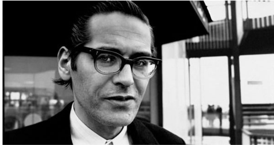
Bill Evans Jazz musician Rusyn mother