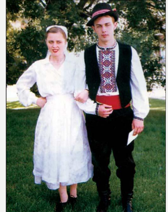
Ruthenian costume from Petrovci, Croatia