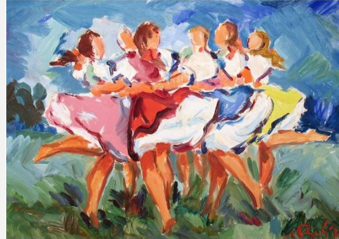
Dancers by Mikulas Rogovsky