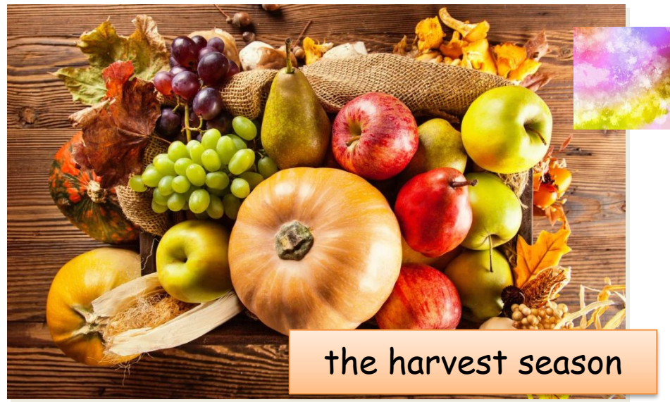
the harvest season