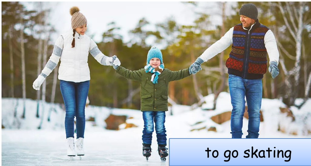
to go skating