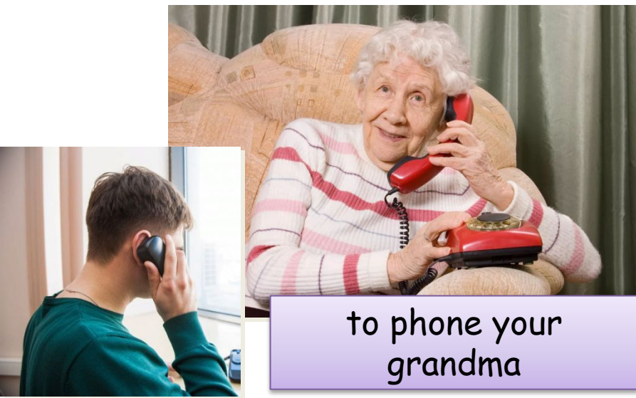
to phone your grandma