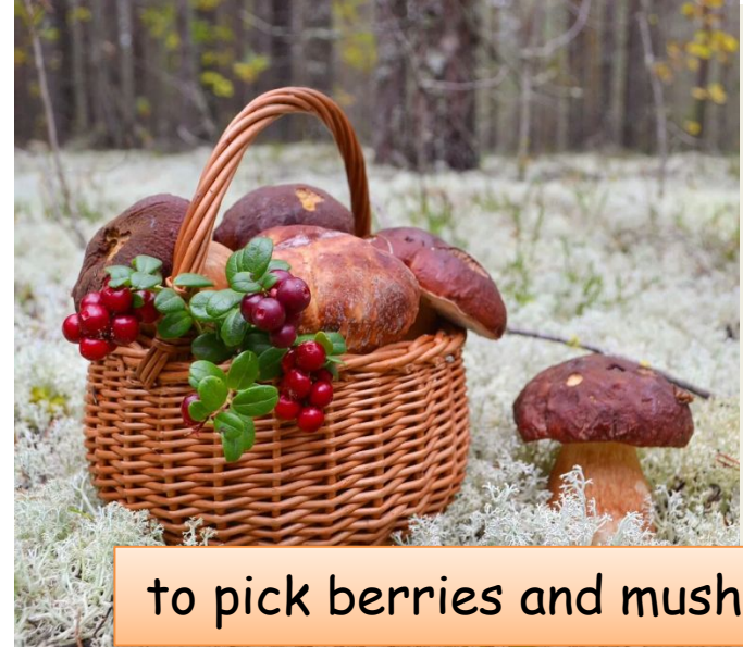
to pick berries and mushrooms