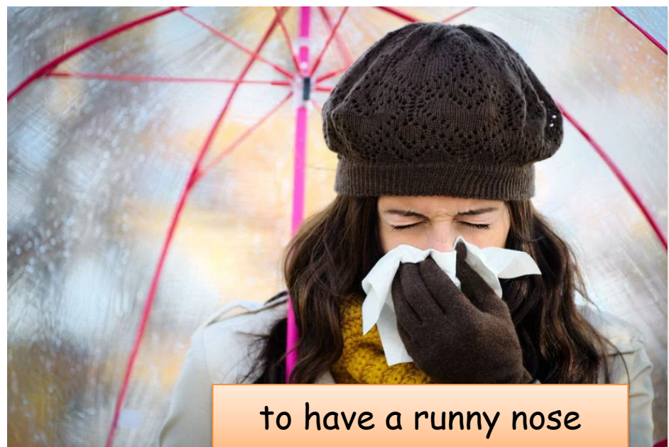
to have a runny nose