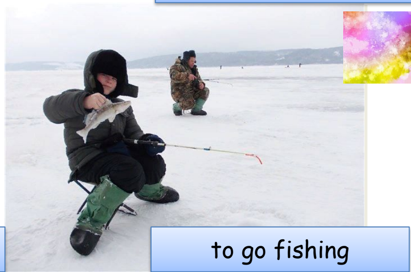
to go fishing