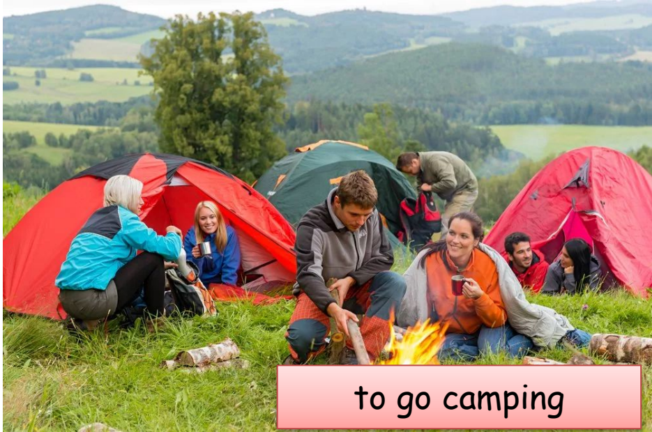
to go camping