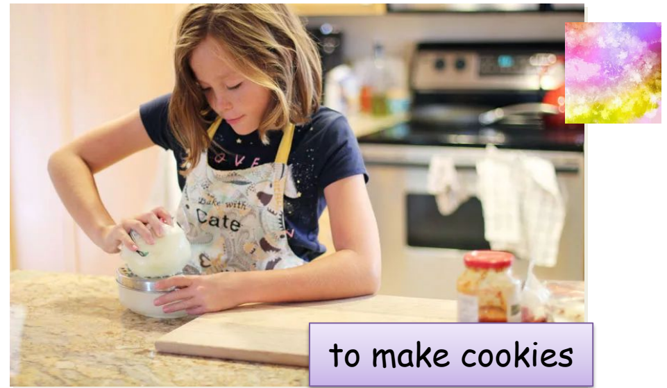
to make cookies