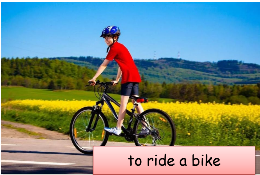
to ride a bike