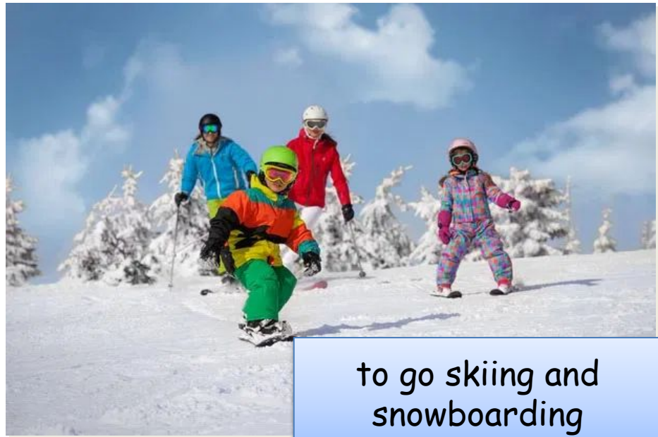
to go skiing and snowboarding