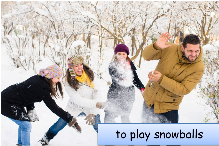
to play snowballs