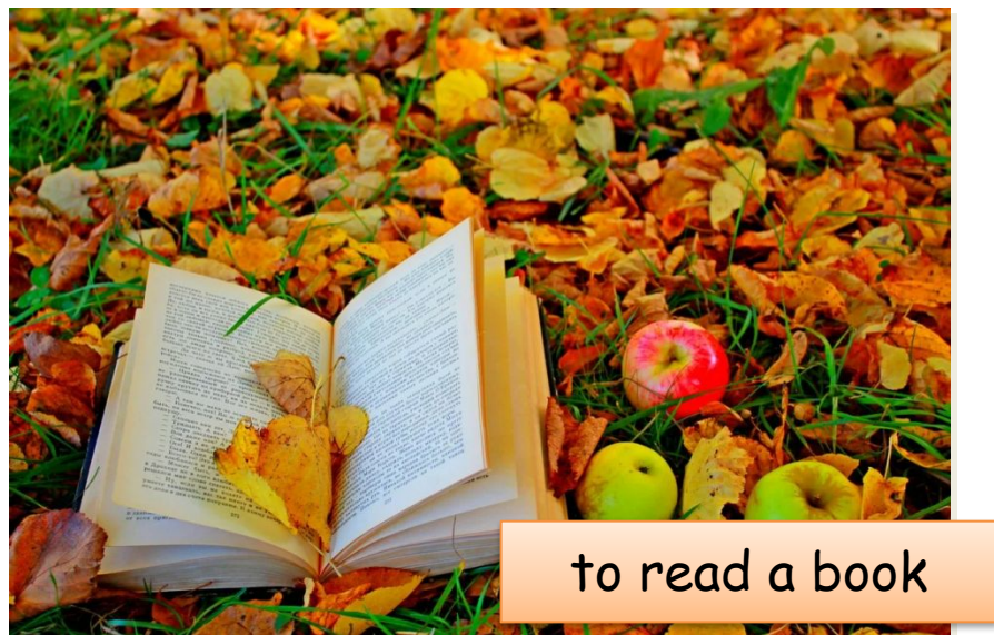
to read a book