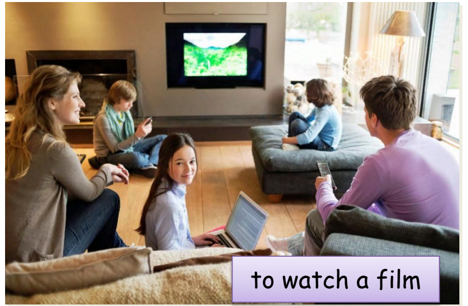
to watch a film