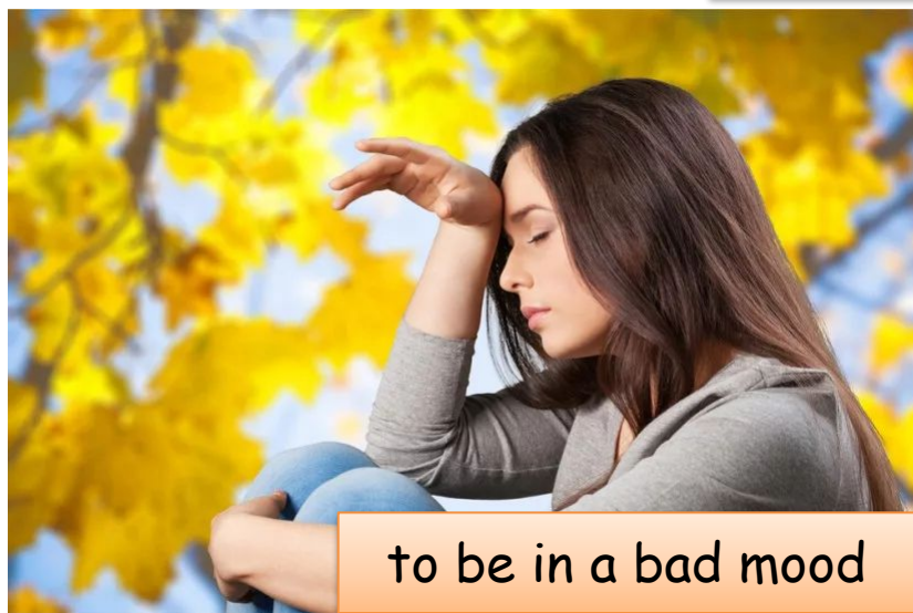
to be in a bad mood