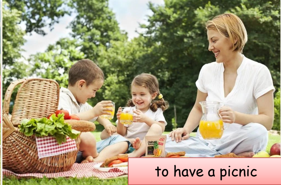
to have a picnic