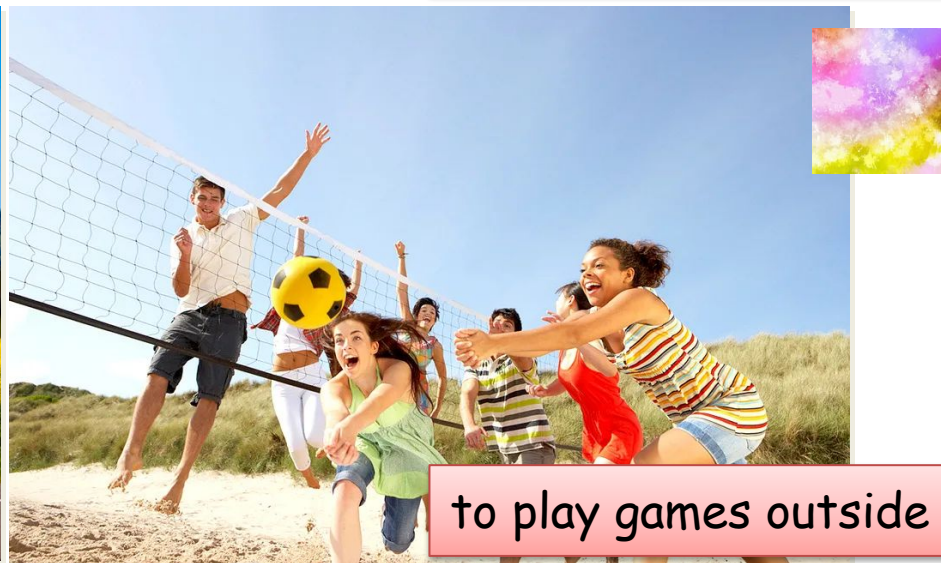
to play games outside