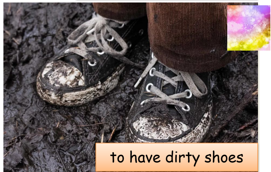
to have dirty shoes