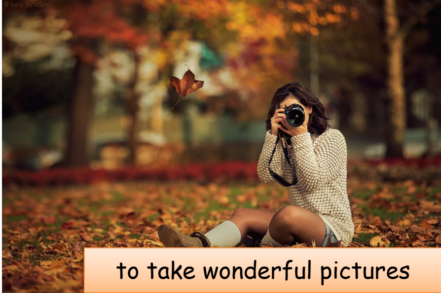
to take wonderful pictures