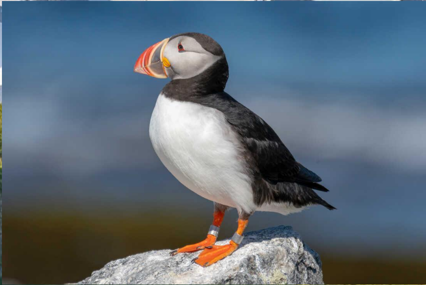
Call of the Atlantic puffin