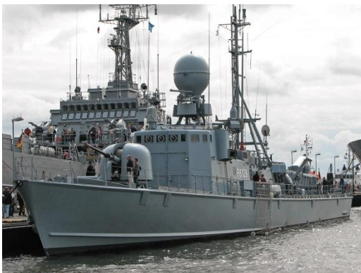
Minor surface combatants