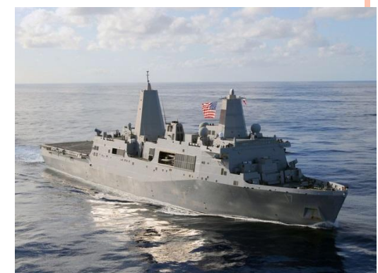
Amphibious warfare vessels