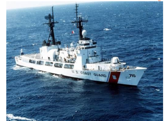
Large Patrol vessels