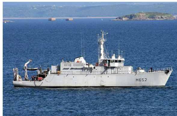
Mine warfare vessels