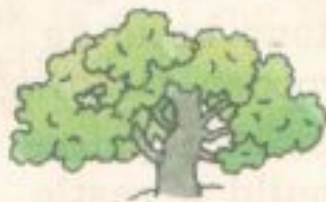
a high tree