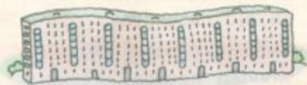
a high building

Только tall употребляют для описания высоких людей: I am tall . My brother is taller than me. He is one metre tall .