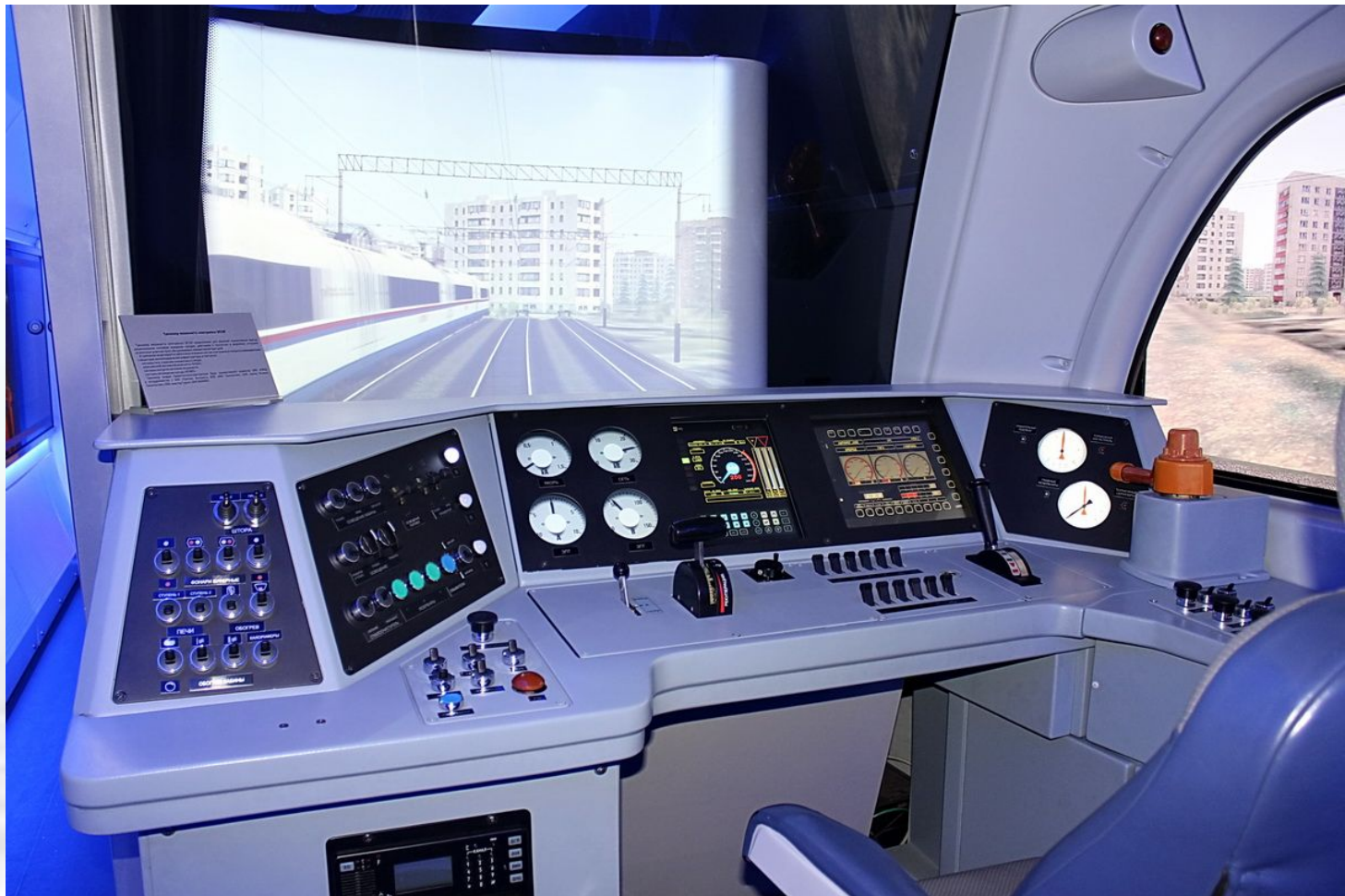
Electric Locomotive Driver trainer EP1M (ЭП1М)