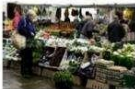
MARKET/(FRUIT AND VEGETABLE) STALLS