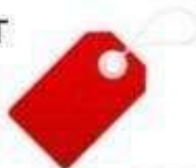
PRICE/ PRICE TAG