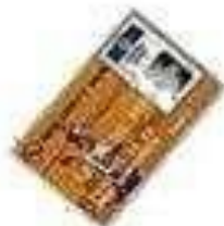
(PAY WITH)CREDIT CARD