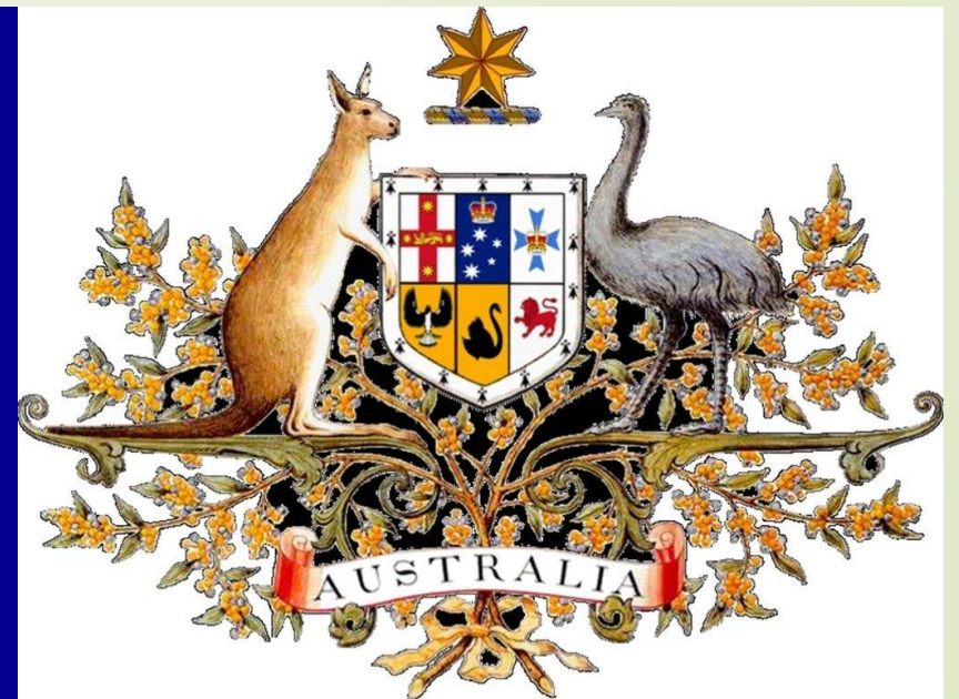
Coat of Arms of Australia