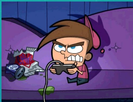
play computer games