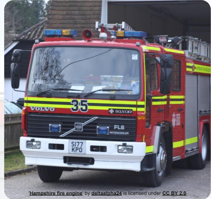
'Hampshire fire engine' by deltaalpha24 is licensed under CC BY 2.0