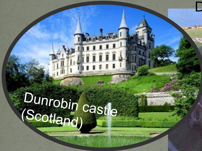
Dunrobin castle (Scotland)