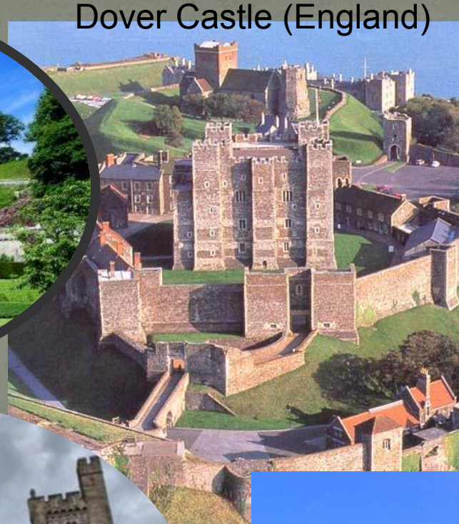
Dover Castle (England)