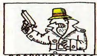
going to the cinema