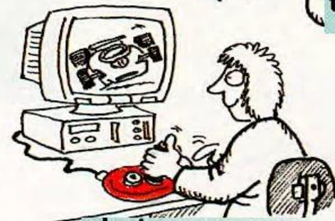
playing computer games