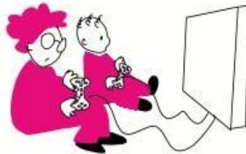
Play video games