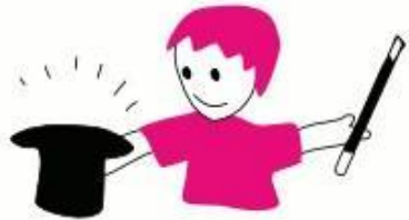
Do magic tricks