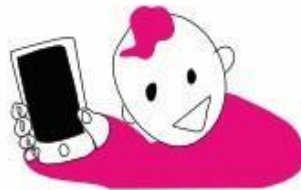
Play with mom's phone