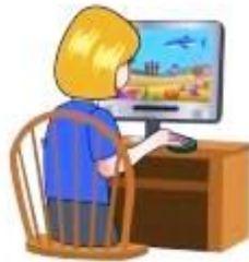
playing computer games