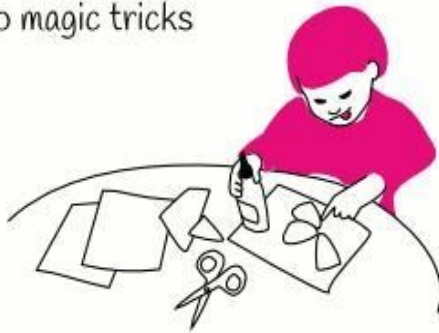
Do arts and crafts