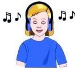
listening to music