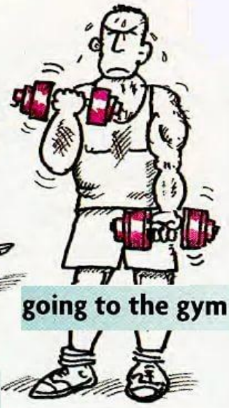
going to the gym