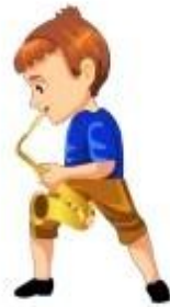
playing an instrument