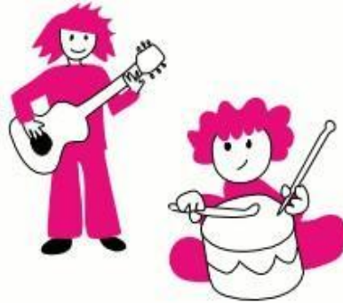
Play an instrument