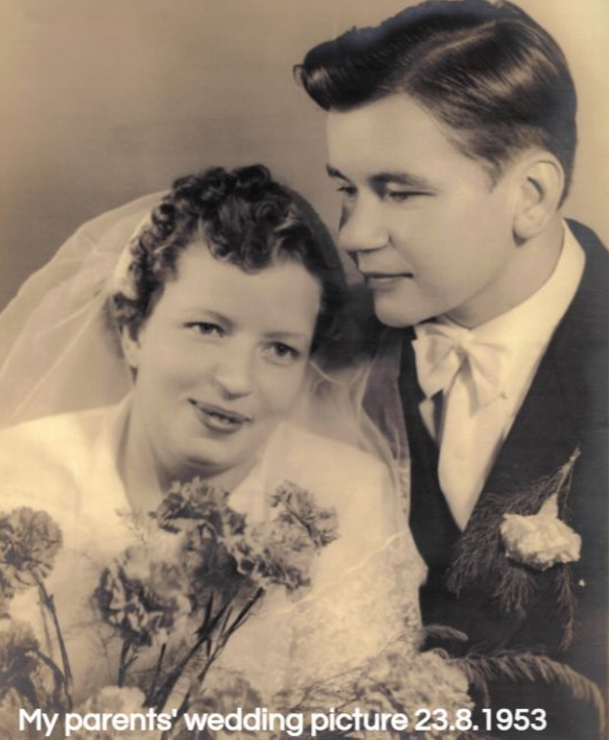
My parents' wedding picture 23.8.1953