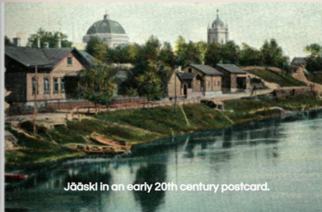
Jääski in an early 20th century postcard.