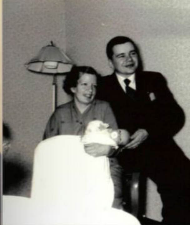
I was baprtized in January 1956.