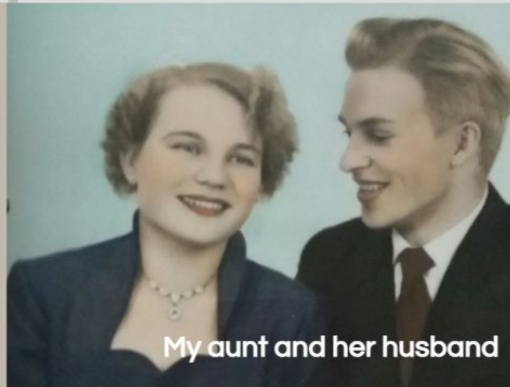
My aunt and her husband