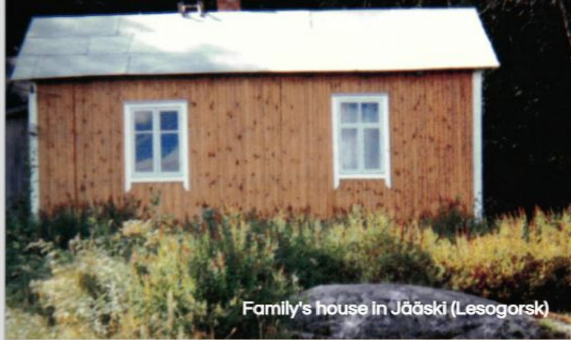
Family's house in Jääski (Lesogorsk)