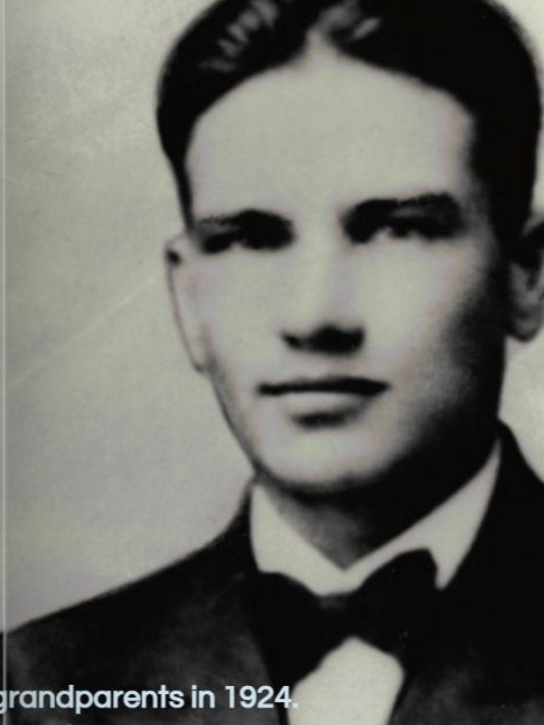
My grandparents in 1924.