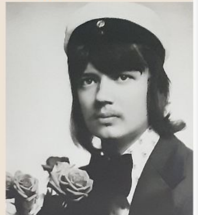
My student picture 31.5.1974.