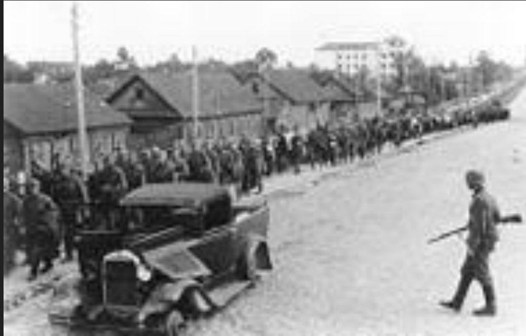
Пленные солдаты Красной армии в Минске (1941 г.)