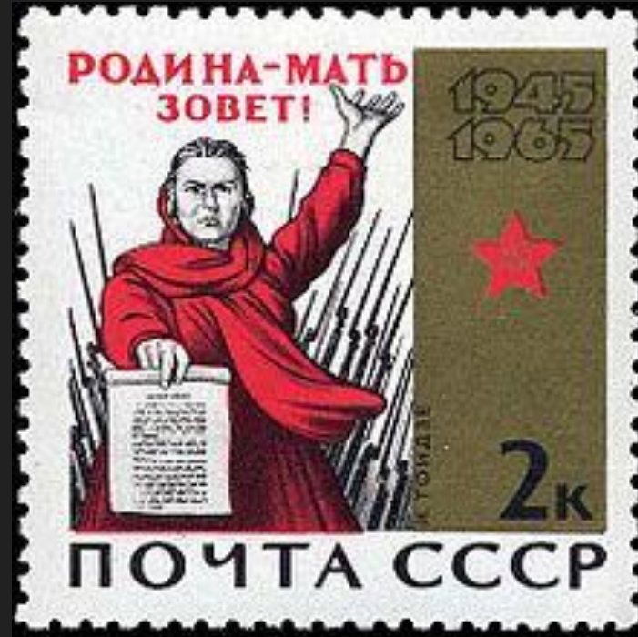
Почтовая марка времён начала войны