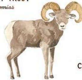
ROCKY MOUNTAIN BIGHORN SHEEP Ovis canadensis canadensis