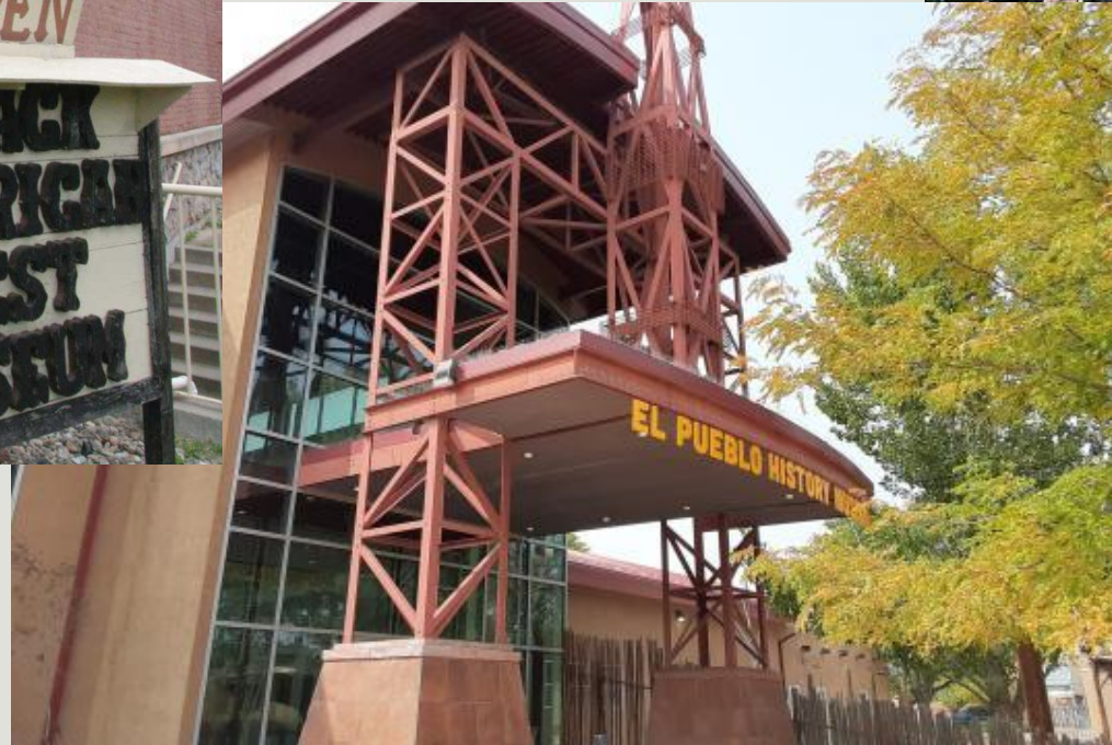
El Pueblo History Museum