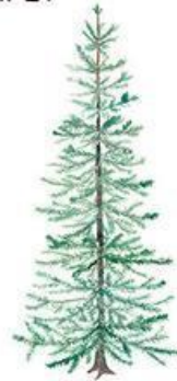
COLORADO BLUE SPRUCE Picea pungens