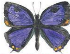
COLORADO HAIRSTREAK BUTTERFLY Hypaurotis crysalis