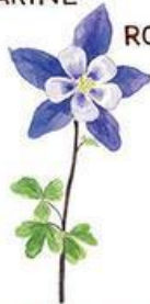
ROCKY MOUNTAIN COLUMBINE Aquilegia coerulea