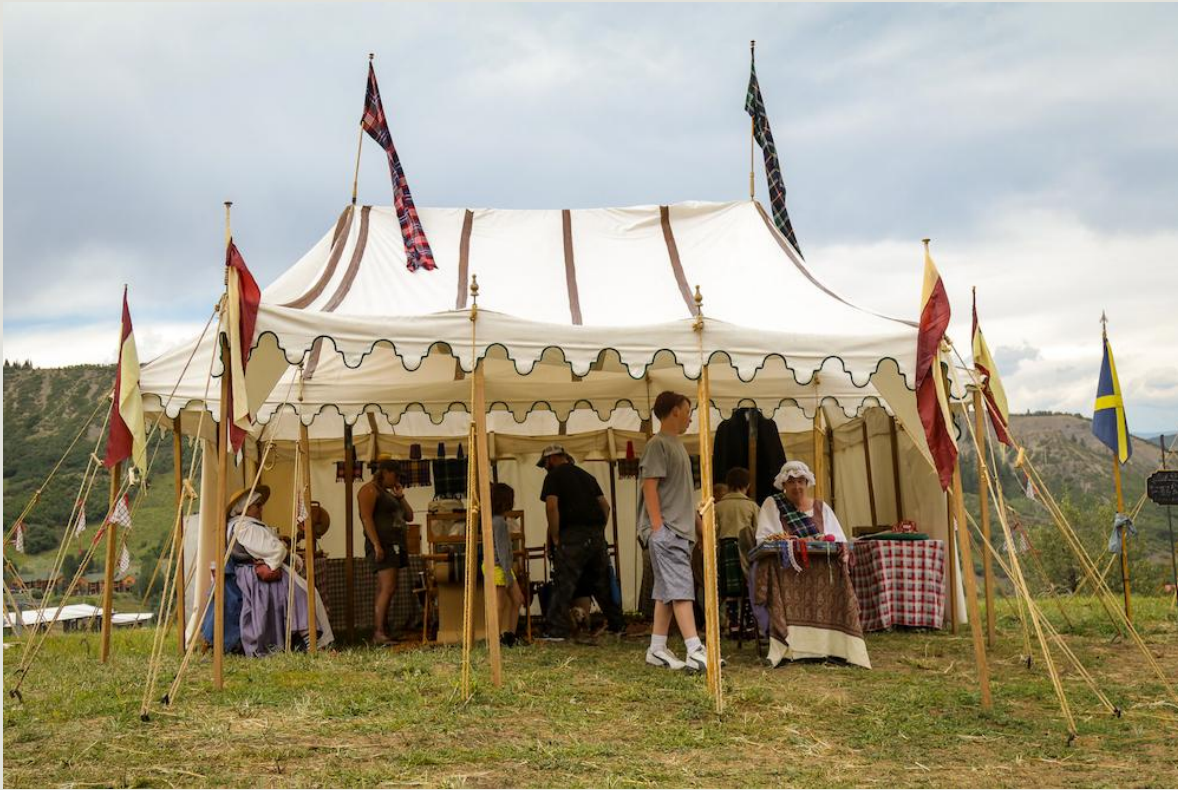
Colorado Scottish Festival