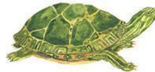
WESTERN PAINTED TURTLE Chrysemys picta