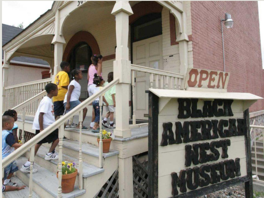
Black American West Museum