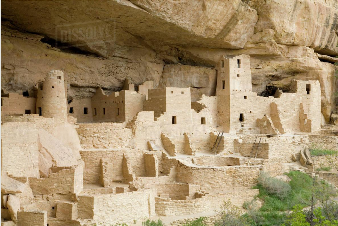
National Park Mesa Verde