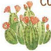
CLARET CUP CACTUS Echinocereus triglochidiatus