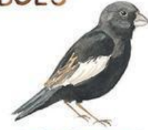
LARK BUNTING Calamospiza melanocorys