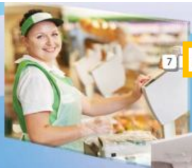
7 shop assistant